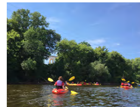
Youth apprentices observed the site on land and from water before preparing design and program plans.