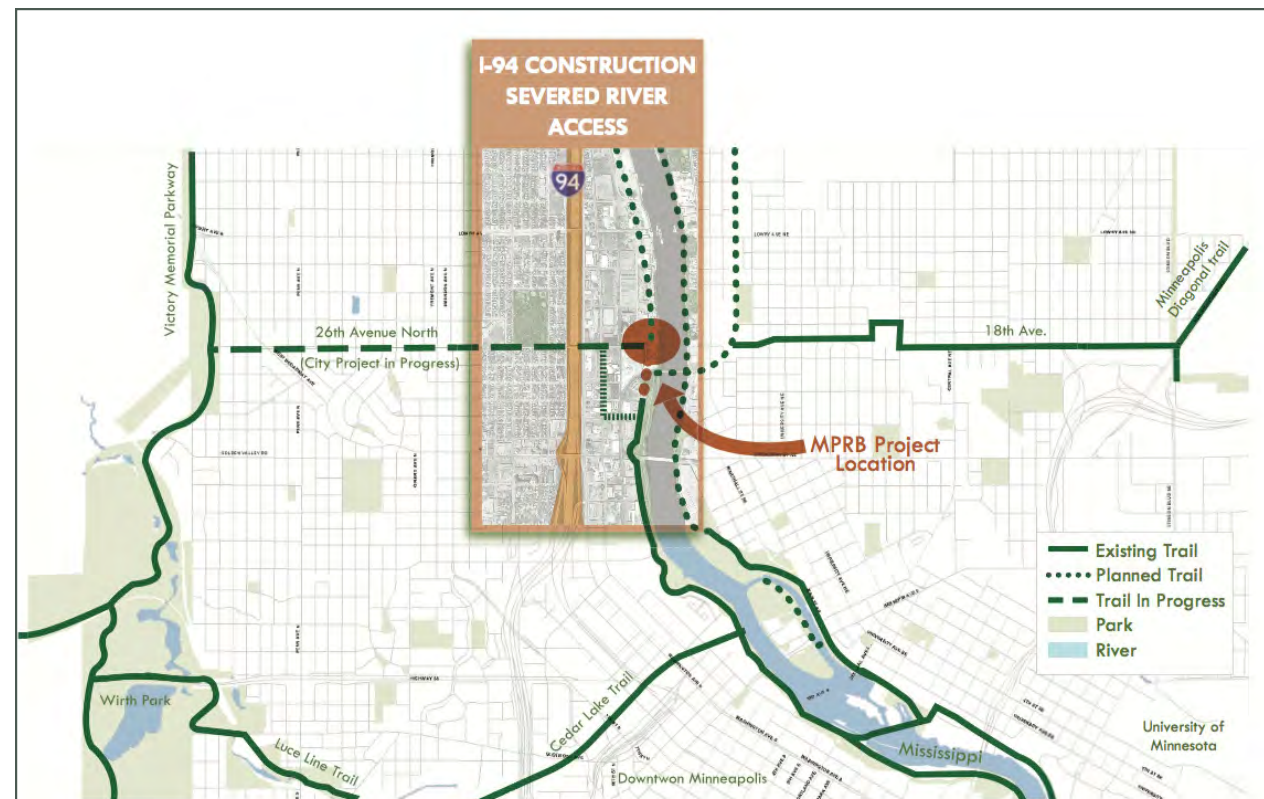
The River Link Pier at 26th Ave N. is located on the Mississippi River and will connect with regional trails.